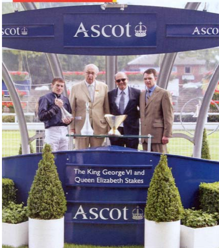
PICTURED A prestigious event, Ascot is second only to football as the UK's most popular spectator sport

Irish Bank began. Although the new stand has come under criticism for failing to offer adequate raised viewing, with a glut of space devoted to money spinning restaurants and corporate hospitality facilities, there's no denying that the new glass and steel structure is a magnificent one. It needs to be – prices for boxes at Royal Ascot in 2009 will range from US$14,000 to US$44,000.